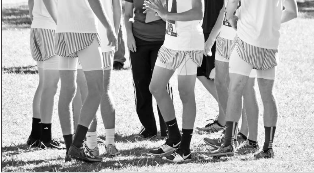
The Union County Cross Country teams and coaches prior to last week's region meet.